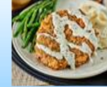
Chicken fried steak